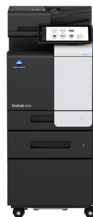
bizhub i-Series 4051i