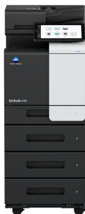
bizhub i-Series 4751i